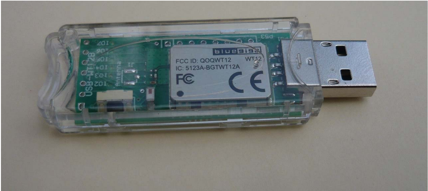
Figure 1 - USB-WT12 device